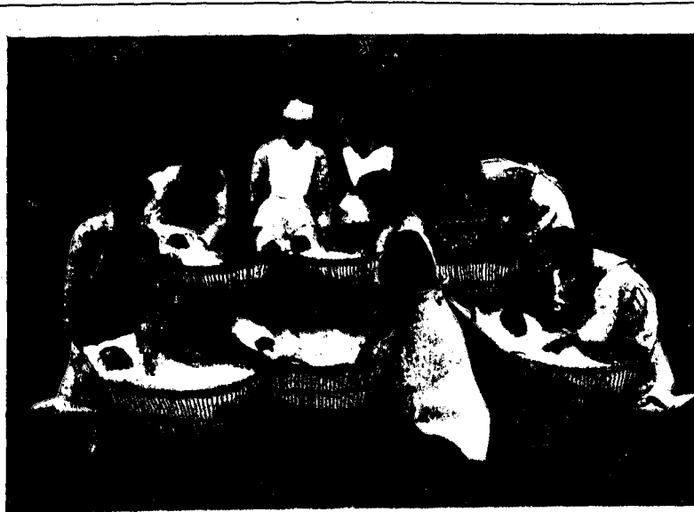
LORNE HOUSE GARDEN—THE BABIES THRIVE IN THE OPEN AIR.